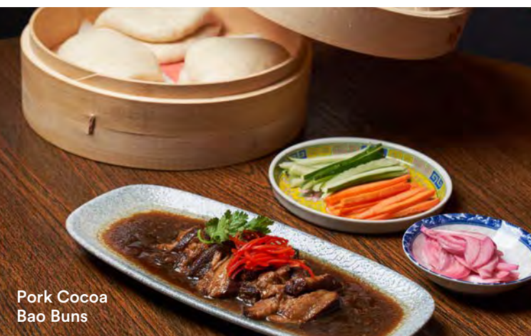
Pork Cocoa Bao Buns

Deep fried sweet potato seasoned with organic herbal seasoning.