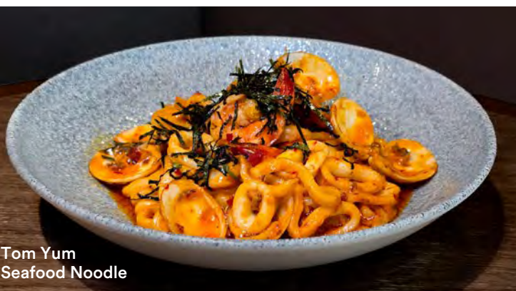
Tom Yum Seafood Noodle

Fried rice served with grilled beef, topped with crispy garlic, shallots, and a silky soy-marinated egg yolk.