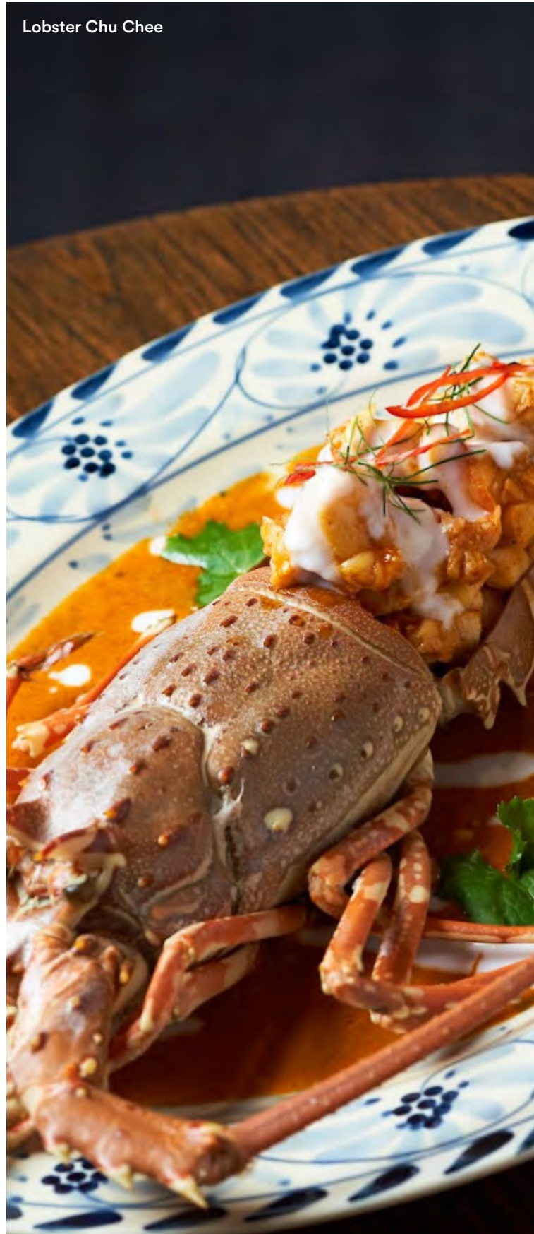
Lobster Chu Chee