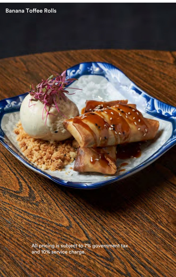
Banana Toffee Rolls

All pricing is subject to 7% government tax and 10% service charge.