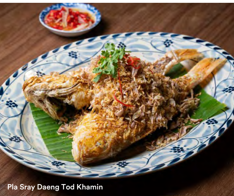
Pla Sray Daeng Tod Khamin

Fresh river prawns, squid, tiger prawns with shallot vinegar, hollandaise and Thai spicy seafood sauce.