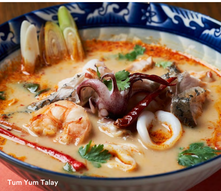
Tum Yum Talay

Red curry with slow cooked roasted duck and pineapple.