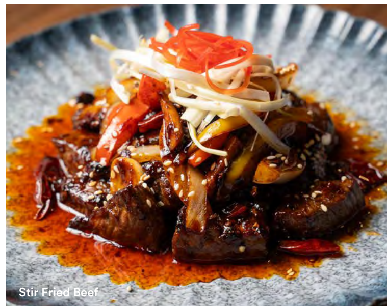
Stir Fried Beef

Stir-fried beef with peppercorn, garlic, sesame oil and mixed vegetables.