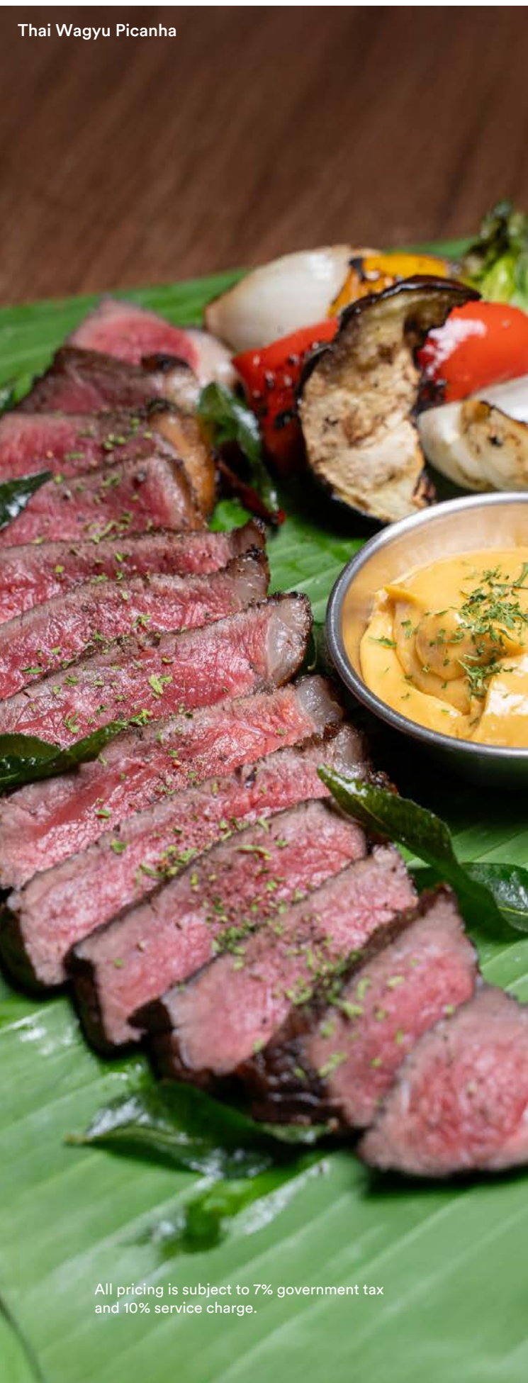
Thai Wagyu Picanha

All pricing is subject to 7% government tax and 10% service charge.